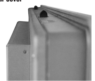
Screw to set up the snap hook out of upper side