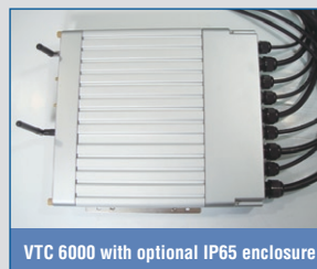
VTC 6000 with optional IP65 enclosure