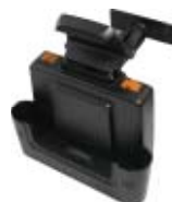
Vehicle Docking Station