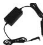
Vehicle Cigarette Adaptor Charger