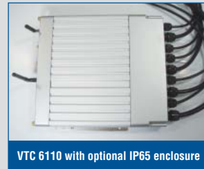
VTC 6110 with optional IP65 enclosure