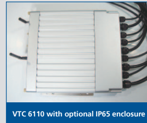
VTC 6110 with optional IP65 enclosure