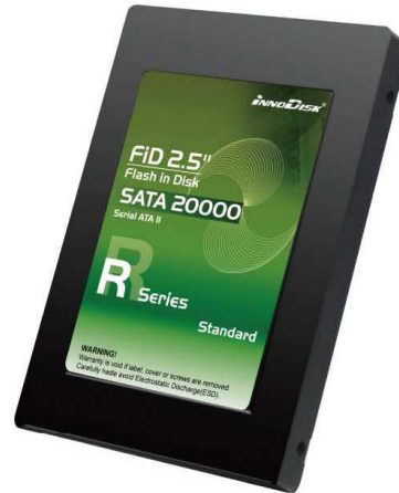
FiD 2.5" SATA 20000 Series

InnoDisk announces FiD 2.5" SATA 20000 SSD with capacity up to 512GB. The new InnoDisk FiD 2.5" SATA 20000 SSD comes in R, H, and X series, that offer outstanding performance and excellent reliability. The R and H series flexibly provide customized functions, including SMART (Self-monitoring, analysis, and reporting technology) and security in both hardware and software. The X series can achieve IOPS over 10000 with file size 4KB.