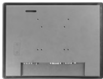
Various Mounting ways Panel/ Wall/ VESA