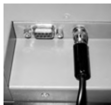
Screw-type Power Input